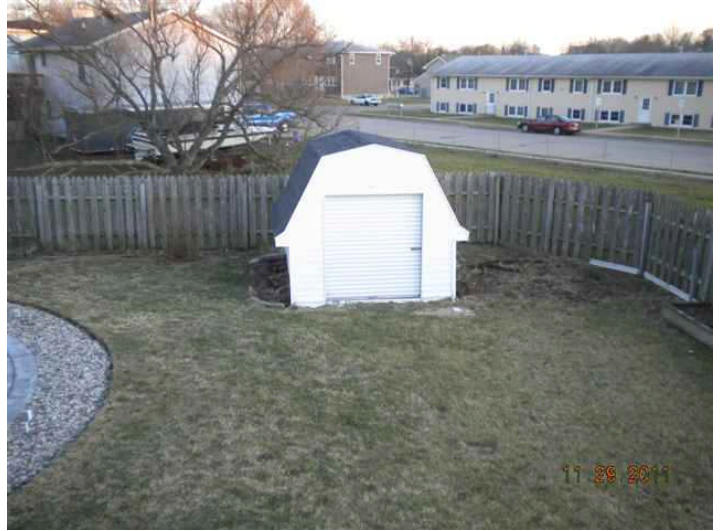
Fenced Back Yard with Shed