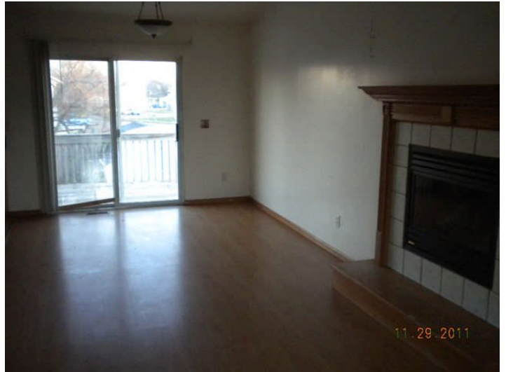
Dining Room with Fireplace & Vaulted Ceiling