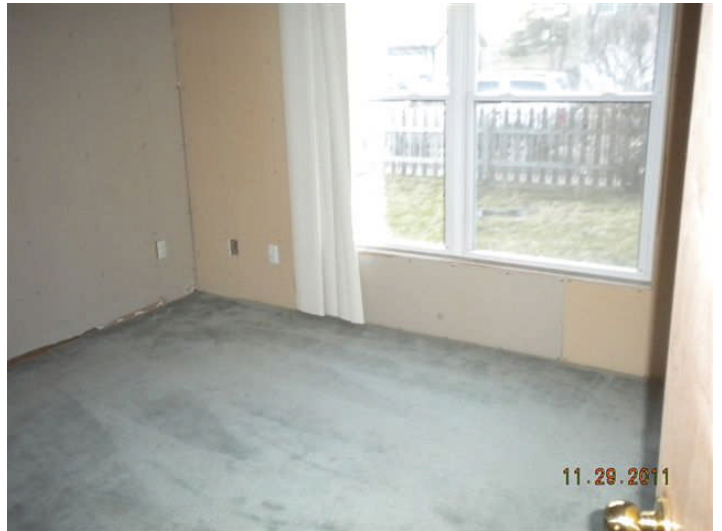
Lower Level Bedroom 4