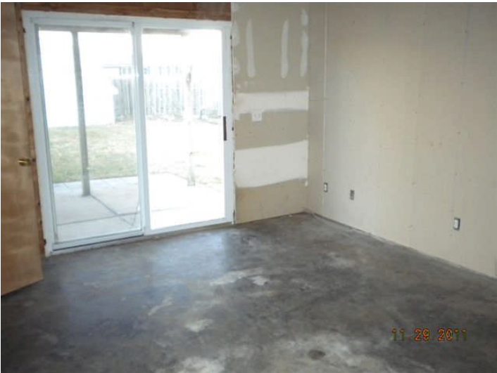
Lower Level Family Room (being finished)