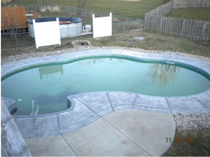
In-Ground Swimming Pool