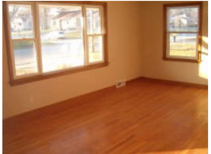
Living Room (another view)