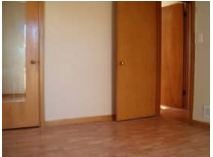
2 nd Bedroom