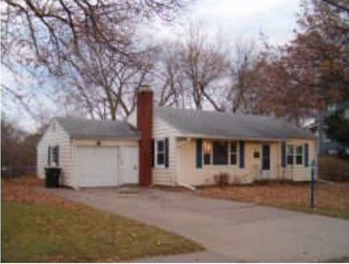
Ranch Home with Attached Garage