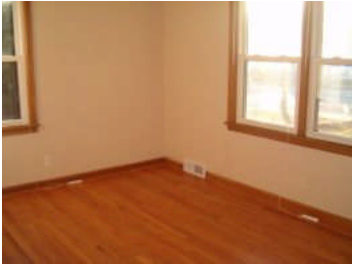
1 st Bedroom