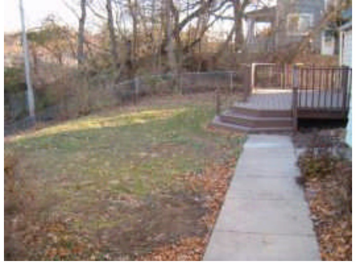
Fenced Back Yard