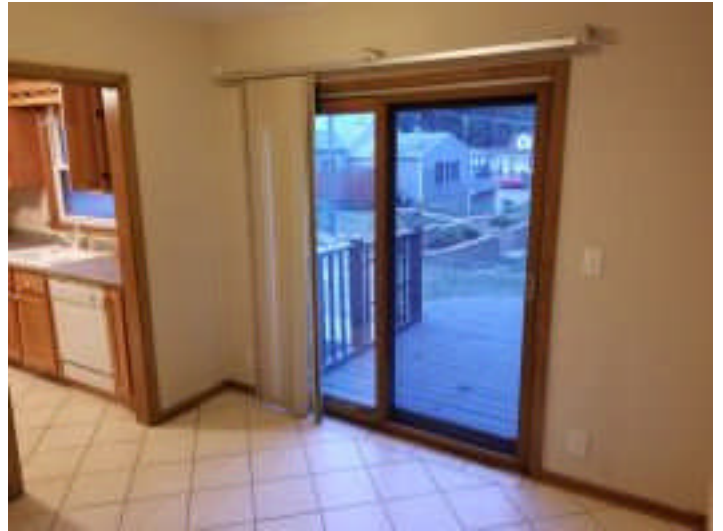
Dining Room with Sliders to Rear Deck