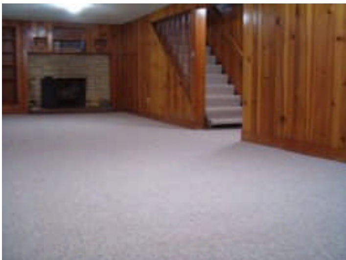
Rec Room with Fireplace & New Carpet