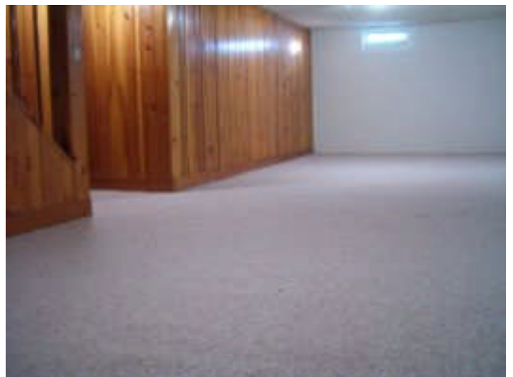
Rec Room (another view)