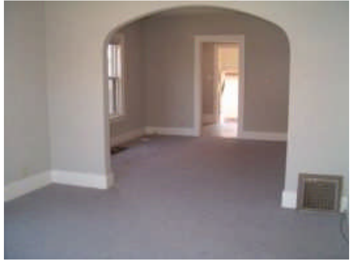
Living Room with view of Dining Room