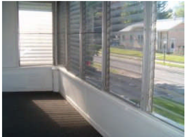
Enclosed Front Porch