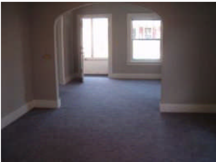
Dining Room with view of Living Room