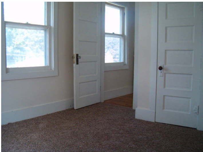
2 nd Bedroom