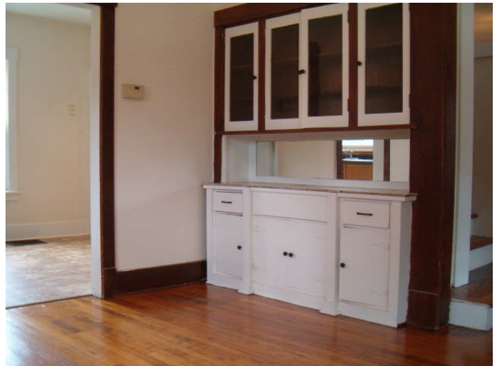
Dining Room Buffet