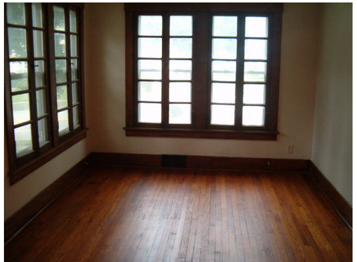
4 Season Room