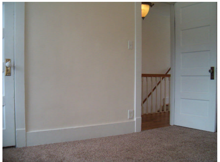
3 rd Bedroom